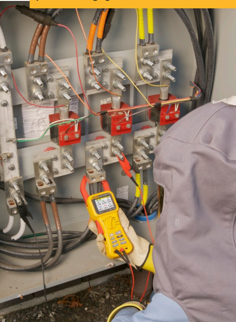
Measuring kW energy consumption will give you a more accurate bid, in far less time, than estimating off of total fixtures.

Building owners and facility managers are looking for the right electrical contractor to implement lighting upgrades. Knowing how to successfully bid and execute a lighting upgrade project is the key to winning these contracts. Fortunately, the tools are readily available to join this emerging market.