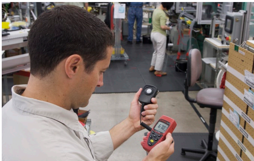
Use a light meter that allows you to select footcandles to measure illuminance.

To measure illuminance, use a light meter that allows you to select footcandles or Lux as the unit of measurement. Turn on the meter and press the "Zero" button with the cover over the sensor to automatically adjust the meter to zero. Select whether to read out in footcandles or lux. Remove the cap from the sensor and survey the room for illuminance levels by holding the sensor perpendicular to the light source. Your lighting supplier will need to know how much illuminance is required for the space. You will enter the footcandles, (or lux), as read on your light meter into the software.